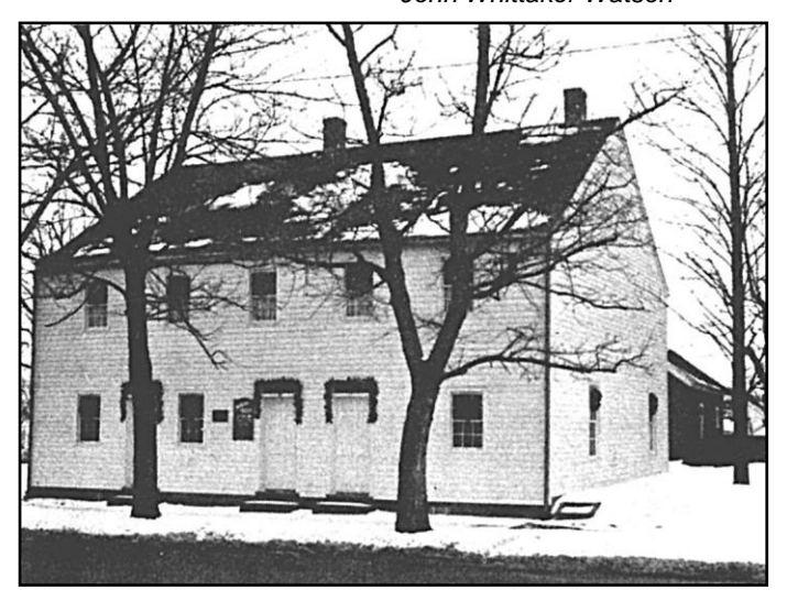
N.B.H.A. Museum as it looked in December 1989