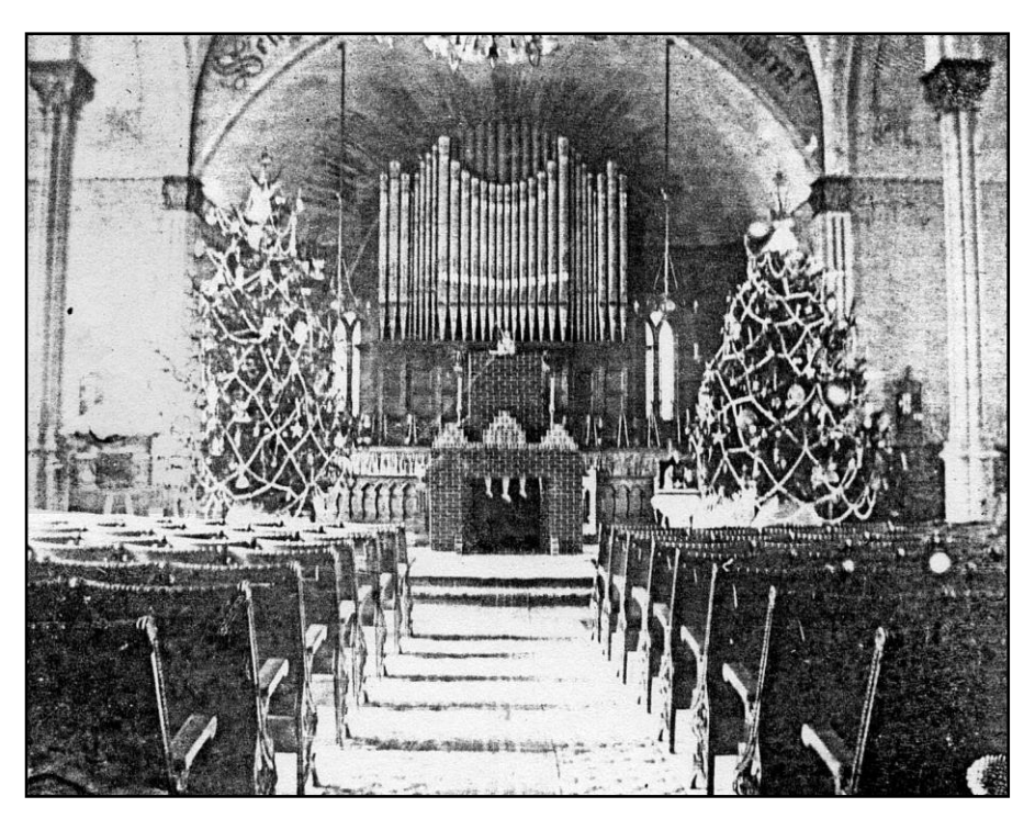
Altar at St. Paul's Church at Christmas time

The hostess usually served doughnuts and